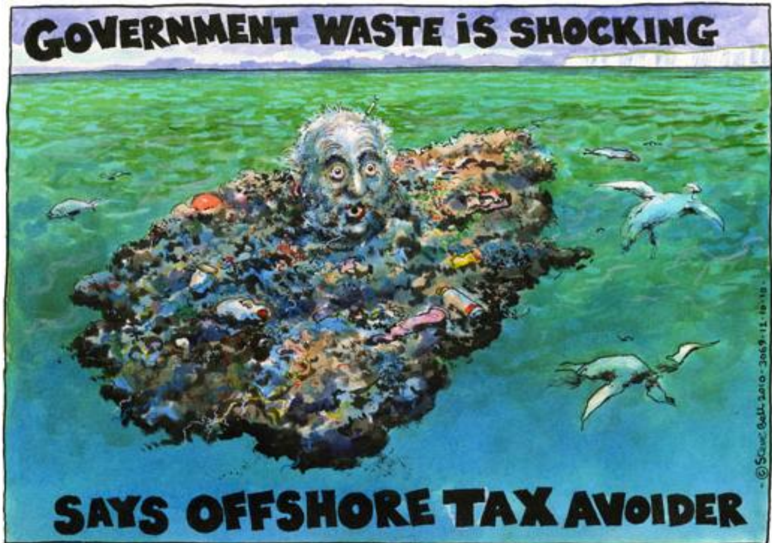
© Steve Bell 2010 (reproduced with permission)